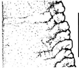
Fig.3- DGM 859-R, detail of the denticles of the same tooth of figure 1 (drawing). Scale bar: 10mm.

Compared with DGM 859-R, the most distinctive of Kellner's morphotypes are the third (KM-3) and fourth (KM-4), which have an oval cross-section, and longer denticles. The number of denticles per millimeter also differs (varying in KM-3 and KM-4 from 3 to 1.5, depending on the position on the carina, if anterior or posterior margin). KM-4 further differs by having a split anterior carina, a feature only known in dinosaurs (KELLNER, 1996).